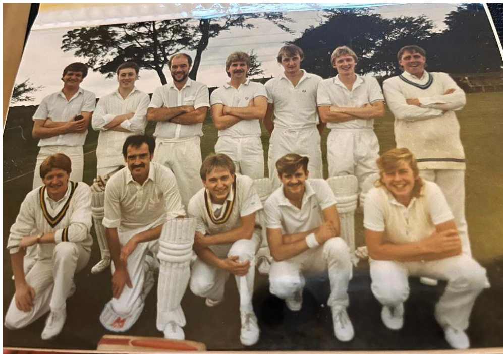
Crossley Shield runners-up 1986 (Simon will buy a pint to the first person to correctly name them all)