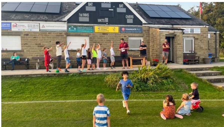
Junior Presentation Night