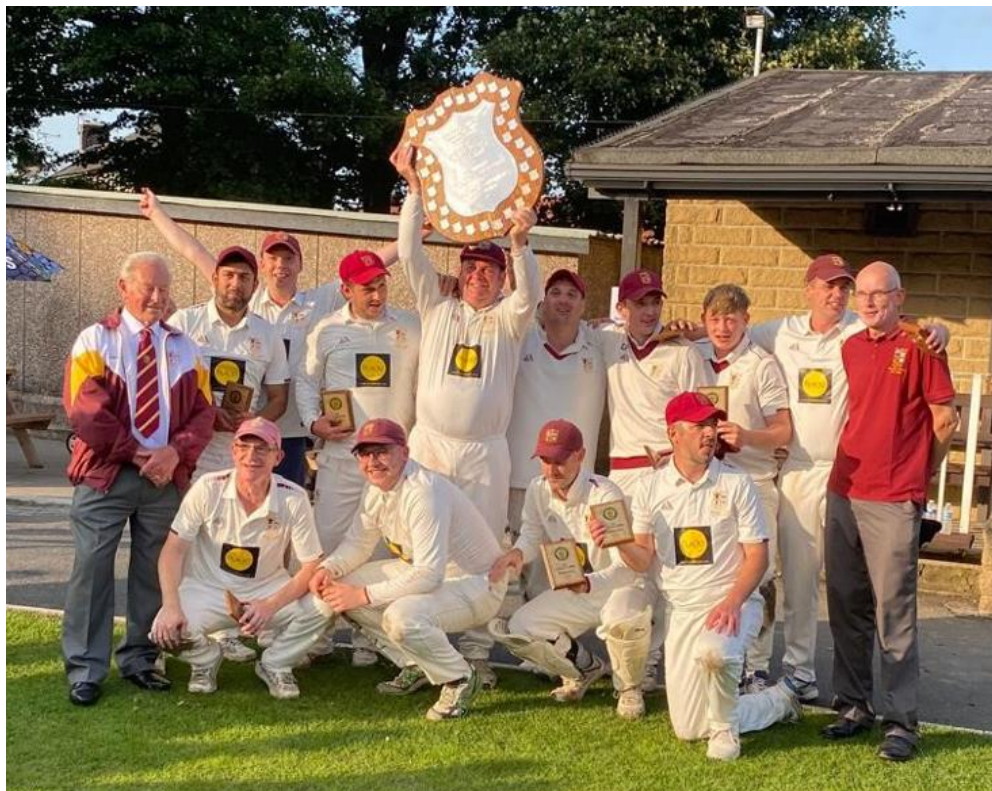
Crossley Shield Winners 2023